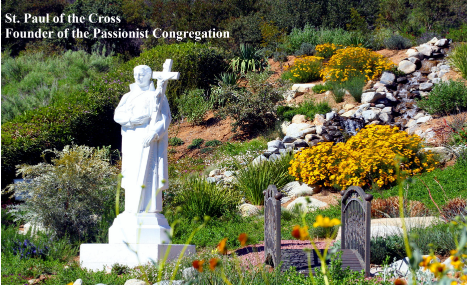
St. Paul of the Cross Founder of the Passionist Congregation

There are many ways to give, and gifts of all sizes are greatly appreciated. It is our pledge and commitment to you that we will respectfully use your gift for the purpose for which it was given.