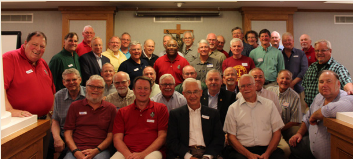
2017 Reunion, Louisville, Kentucky.