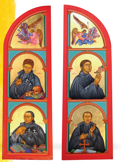
Author's note: Each location should try to have an enthronement service with the icon, and/or a relic of St. Paul of the Cross. Appropriate songs and incense may enrich the service.

Undertake a small commitment: draw near to someone who needs your welcoming gesture, your friendly word, and your joyful glance. Name someone.